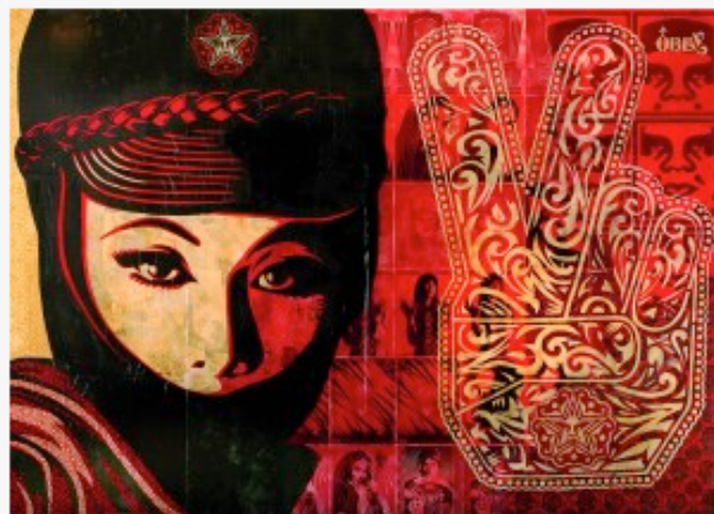
"Mujer Fatal" by Shepard Fairey

Shepard Fairey is probably best known for his iconic, stylized portrait of Barack Obama, accented by the word "HOPE," one of the most memorable images of the last presidential campaign. He originally gained notoriety by translating pop culture imagery into guerilla propaganda campaigns, most prominently with his ubiquitous "OBEY" images. Fairey's recent work involves complex, multi-layered portraits of counter-cultural revolutionary figures combined with politically-charged propaganda style imagery. He's currently the subject of a major traveling museum survey, " Shepard Fairey: Supply and Demand. "